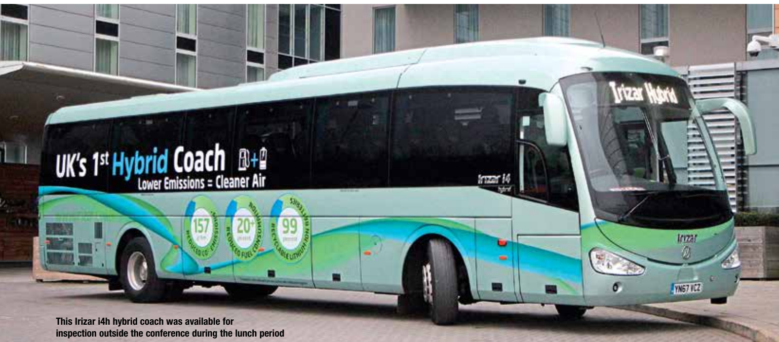
This Irizar i4h hybrid coach was available for inspection outside the conference during the lunch period